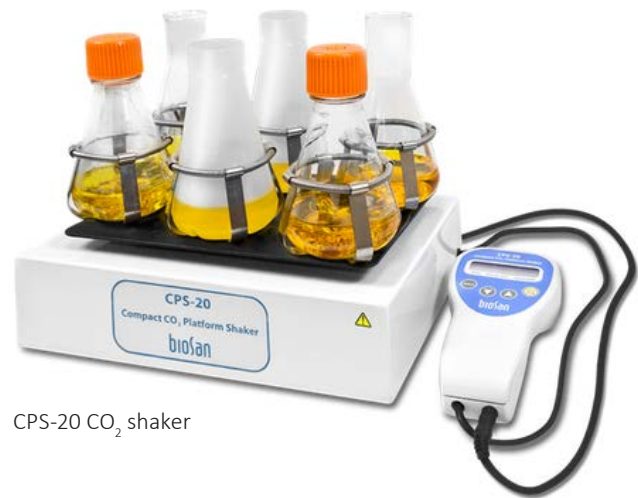
CPS-20 CO 2 shaker

The specially designed remote control protects the electronics from the CO 2 environment of the incubator. In addition, the remote control minimises disturbance to the incubator environment and the experiment in progress.